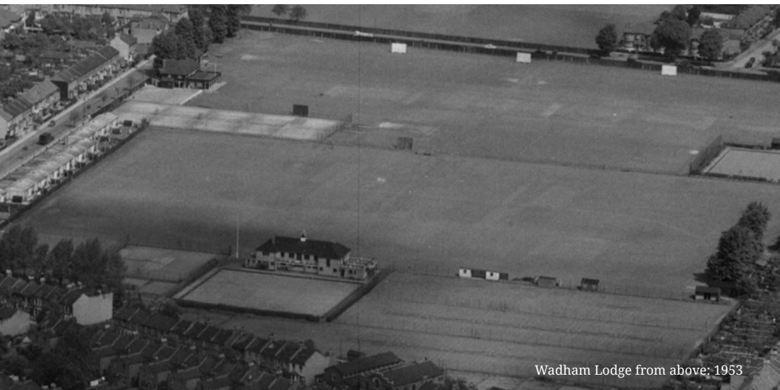
Wadham Lodge from above; 1953