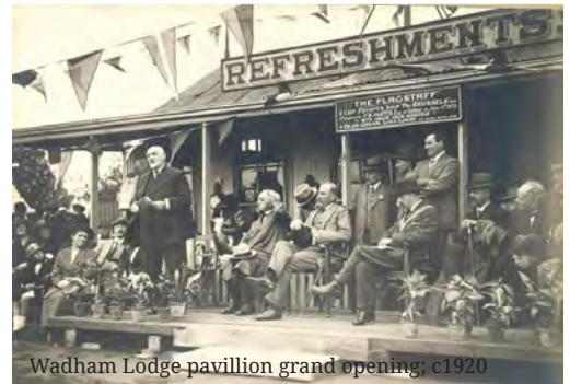
Wadham Lodge pavillion grand opening; c1920

In 2008 a local businessman took over the main lease