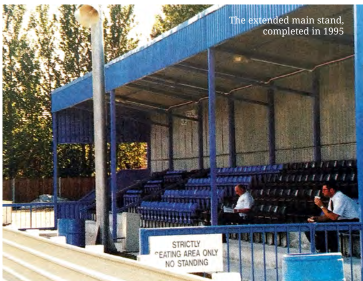
The extended main stand, completed in 1995

Here's to hoping for at least another 101 years of sport at Wadham Lodge.