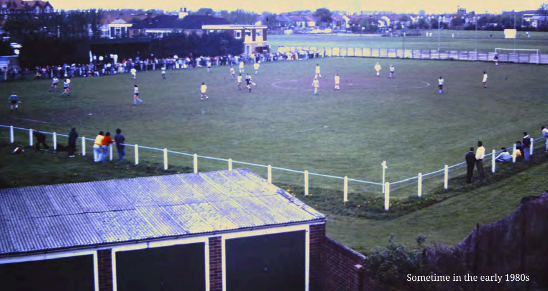
Sometime in the early 1980s

for the ground and installed a new 3G full-size astroturf pitch and smaller 5-a-side 'cages'; most of which had to be rebuilt not long after. One of the businessman's lasting decisions was that not to renew Waltham Forest FC's lease, and the club spent five seasons playing at Ilford's Cricklefields Stadium